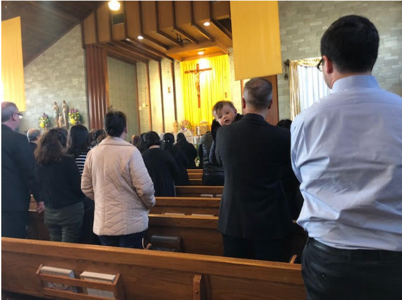
Taken at today's Funeral Mass in Ascension Church, New Milford, NJ.

"If you know when you have enough, you are wealthy, If you carry your intentions to completion, you are resolute, If you live a long and creative life, you will leave an eternal legacy" – Lao Tzu